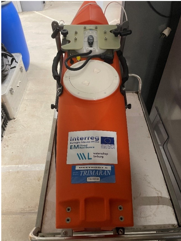
Boat with Interreg sticker / stored at the envisaged location (room in buiding WL)