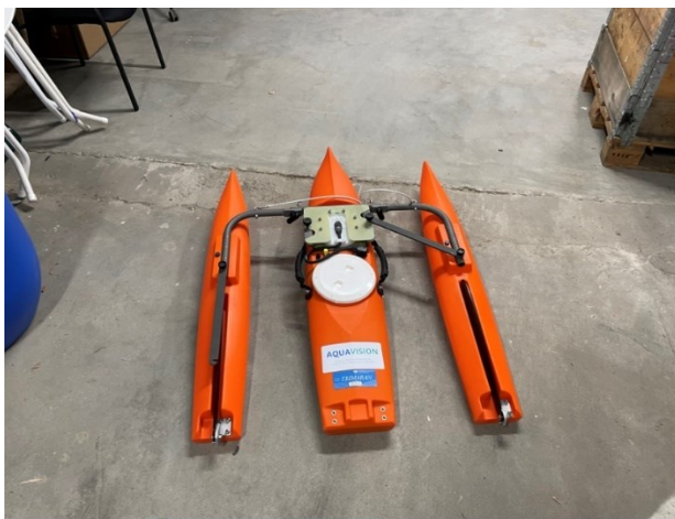
Boat with Interreg sticker