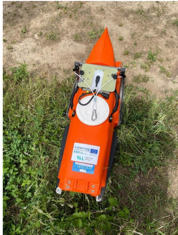
Boat with Interreg sticker